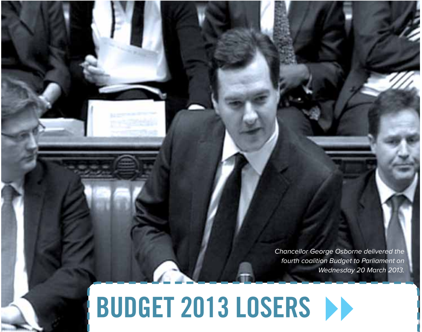
Chancellor George Osborne delivered the fourth coalition Budget to Parliament on Wednesday 20 March 2013.