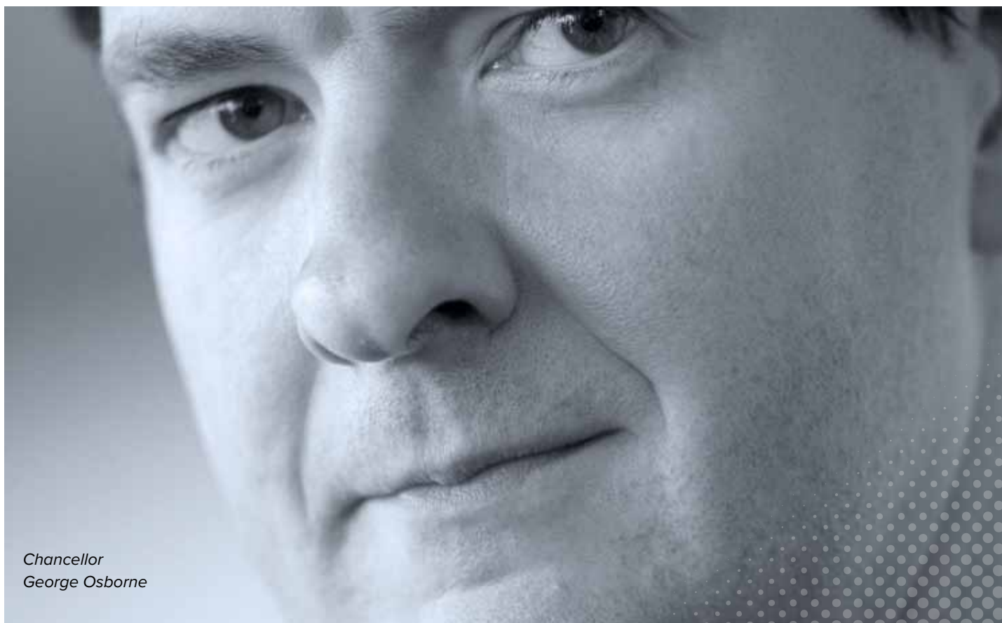
Chancellor George Osborne